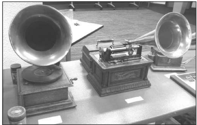
Gramophone manufactured by Victor, and “Graphophone” by Columbia

The first decades of the 20 th century were the “Golden Age” of phonographs. These large pieces of furniture were proudly displayed as a status symbol (especially the size of the horn, although these went out of fashion in the 1920s). As the patents of the first three companies ran out, the industry expanded. After WW1 many factories were converted from military manufacturing to the production of phonographs: in Canada there were forty-eight phonograph manufacturers. In 1929, because of the economic crash, sales dropped dramatically and the industry collapsed. Even with the advent of longer-playing plastic 33rpm and 45rpm records in the 1940s, overall sales never returned to their former levels.