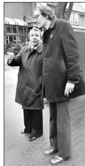
Former Mayor David Crombie with future Mayor John Sewell, November 1978

achieving high density in a liveable neighbourhood. Its 1970s design was collaborative, and developed by a Working Committee established by Crombie, chaired by Sewell, and composed of local residents and councillors. The plan was based on downtown Toronto's 19 th century plan, the new development's alignment and scale reflecting the existing grid of downtown streets and houses. It tested common practice by putting both the public and separate schools in the same building, for example, and successfully avoided the mistakes of inward-looking low-income high-density developments so common in the 1960s and '70s in North America and Britain.