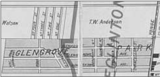
Detail of 1890 map, showing the Glengrove Park development. Lawrence is the road at the top; Yonge Street is far right. The irregular dark line is the western limit of North Toronto.