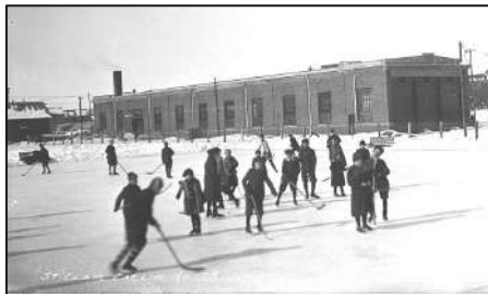
St. Clair car barns, 30 Jan, 1915