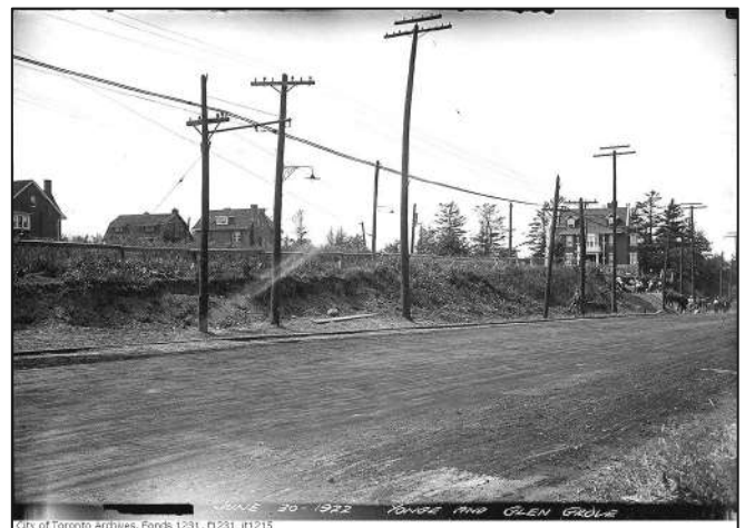
Yonge Street, looking north to Glengrove in 1922 There was still plenty of vacant land for building.