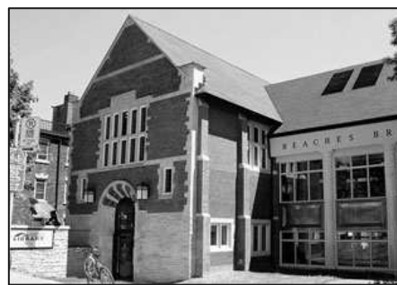
Beaches Branch, today TPL