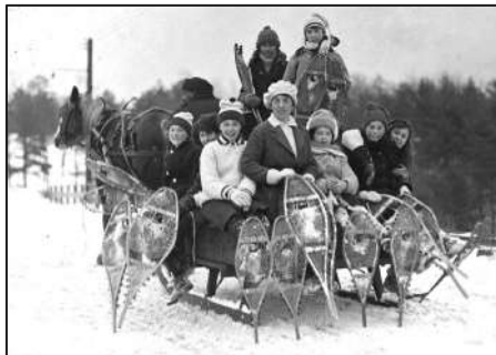
Group of snowshoers on horse-drawn sleigh, c.1920 CTA