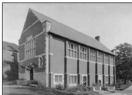
High Park Branch, c.1916 TPL