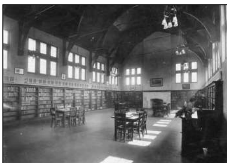
Wychwood Branch, c.1916