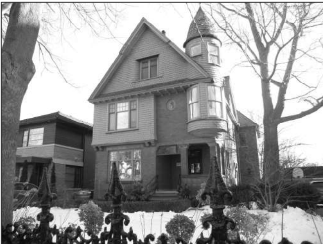
117 Glengrove today